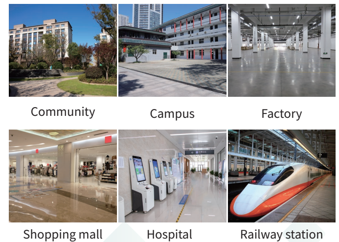
Community Campus Factory Shopping mall Hospital Railway station