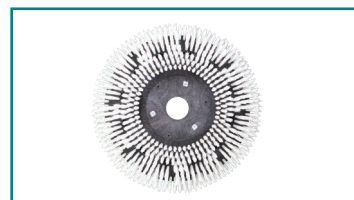
19" Brush (optional) PP 0.28