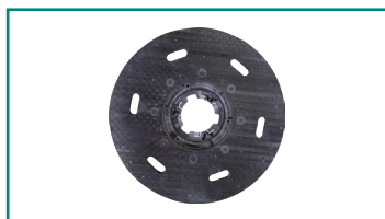
19" Pad holder (optional)