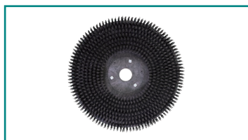
19" Brush PP0.6